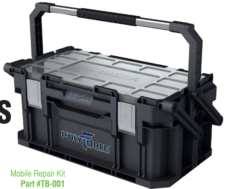
Mobile Repair Kit Part #TB-001